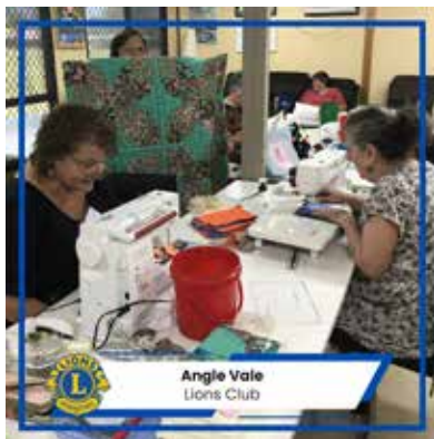
Angle Vale Lions Club