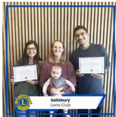
Salisbury Lions Club