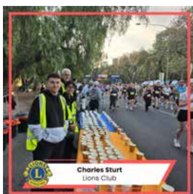
Charles Sturt Lions Club