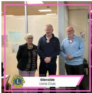
Glenside Lions Club