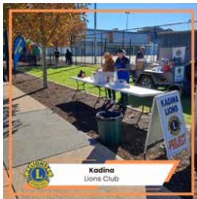
Kadina Lions Club