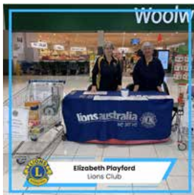
Elizabeth Playford Lions Club