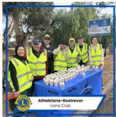
Athelstone-Rostrevor Lions Club