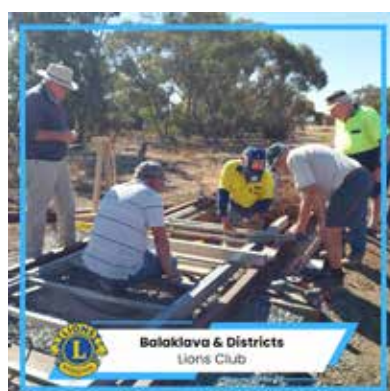
Balaklava & Districts Lions Club