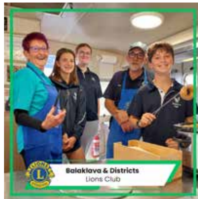
Balaklava & Districts Lions Club