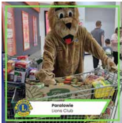
Paralowie Lions Club