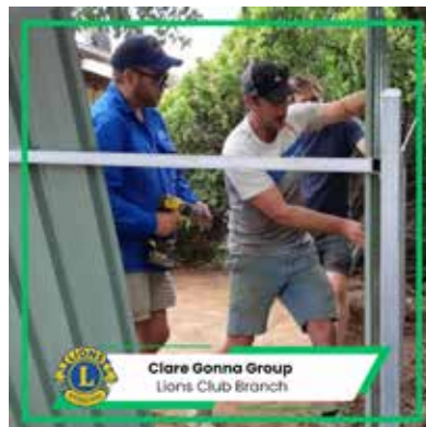
Clare Gonna Group Lions Club Branch