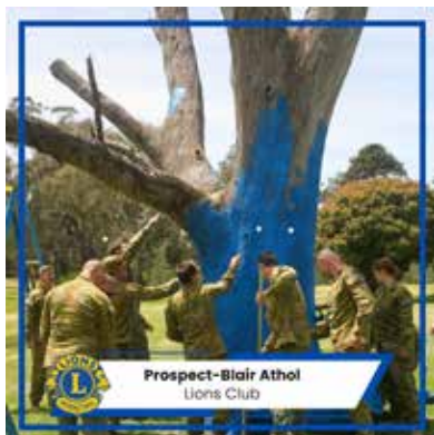
Prospect-Blair Athol Lions Club