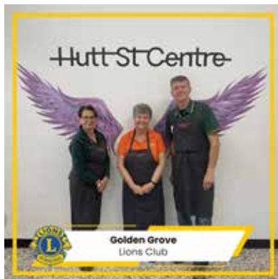
Golden Grove Lions Club