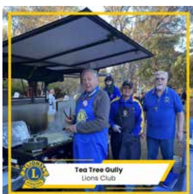
Tea Tree Gully Lions Club