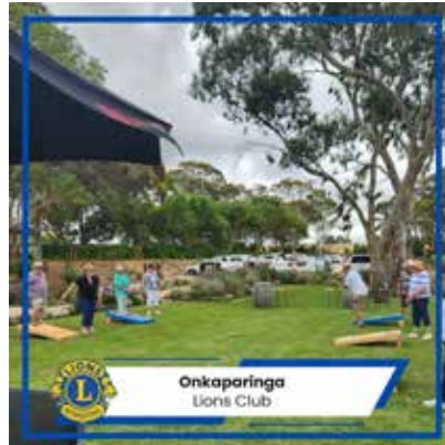
Onkaparinga Lions Club