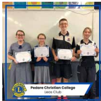
Pedare Christian College Lions Club