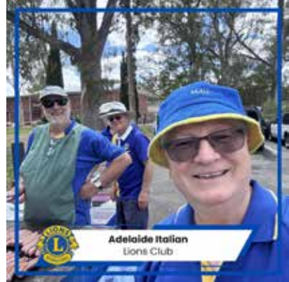
Adelaide Italian Lions Club