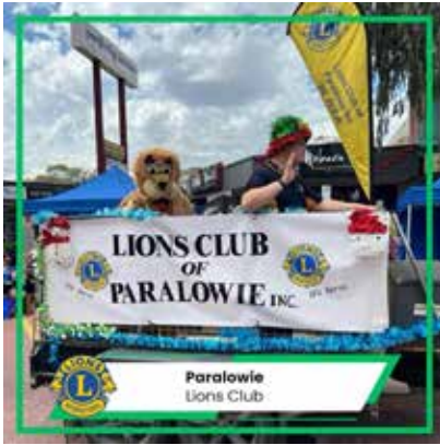
Paralowie Lions Club