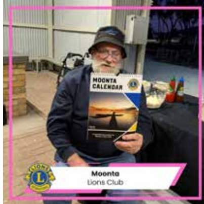
Moonta Lions Club