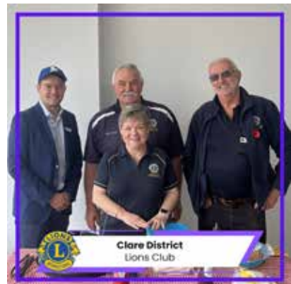
Clare District Lions Club