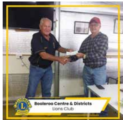
Booleroo Centre & Districts Lions Club