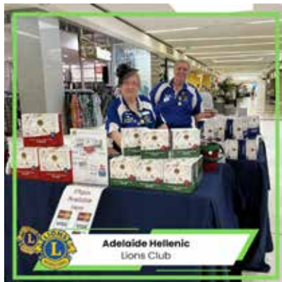
Adelaide Hellenic Lions Club