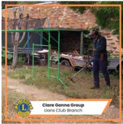
Clare Gonna Group Lions Club Branch