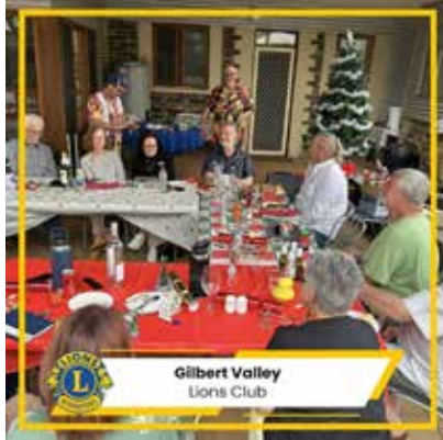
Gilbert Valley Lions Club