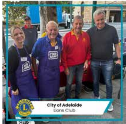
City of Adelaide Lions Club