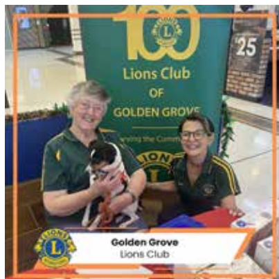
Golden Grove Lions Club