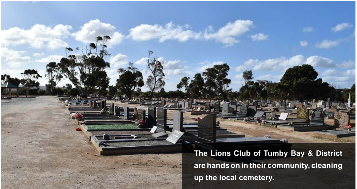
The Lions Club of Tumby Bay & District are hands on in their community, cleaning up the local cemetery.