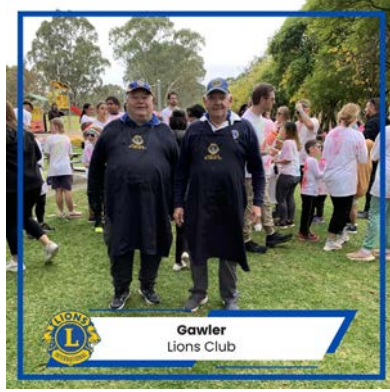
Gawler Lions Club