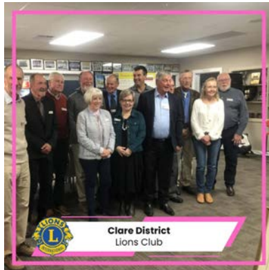
Clare District Lions Club