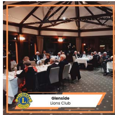
Glenside Lions Club