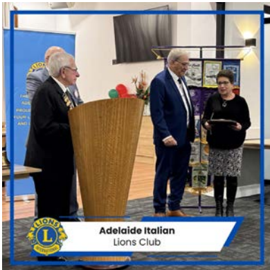
Adelaide Italian Lions Club