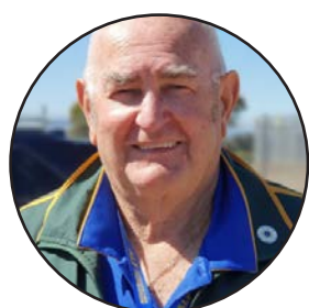
PDG Lance Leak OAM Lions Clubs International Foundation (LCIF)