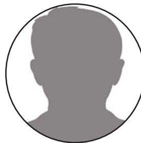
TBA Zone 1 Chairperson