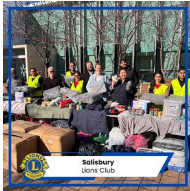
Salisbury Lions Club