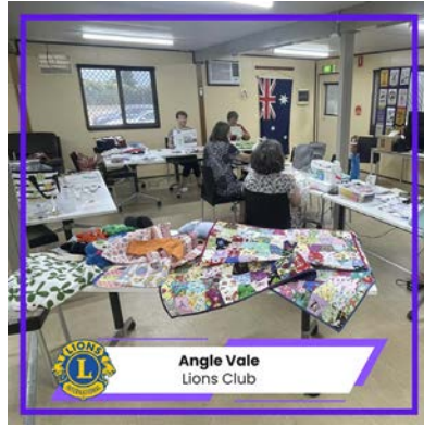
Angle Vale Lions Club