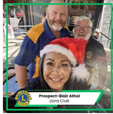
Prospect-Blair Athol Lions Club