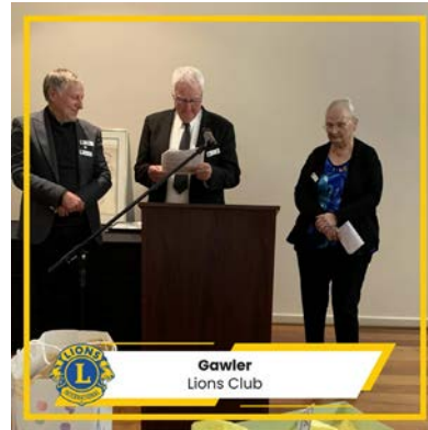
Gawler Lions Club