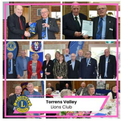
Torrens Valley Lions Club