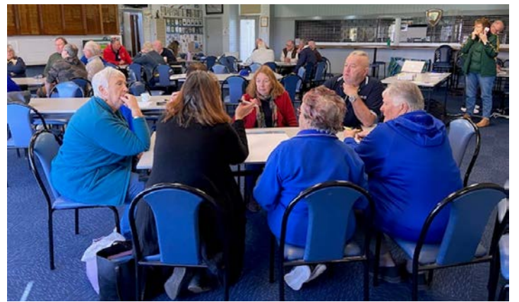
Training day Port Pirie.