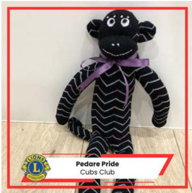
Pedare Pride Cubs Club