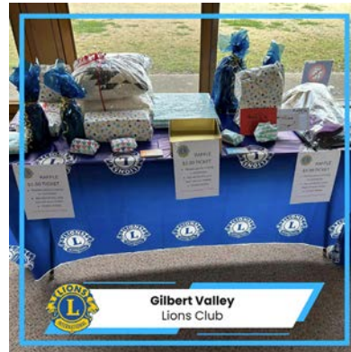
Gilbert Valley Lions Club