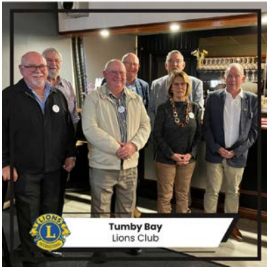
Tumby Bay Lions Club