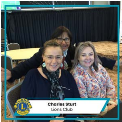
Charles Sturt Lions Club