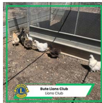
Bute Lions Club Lions Club