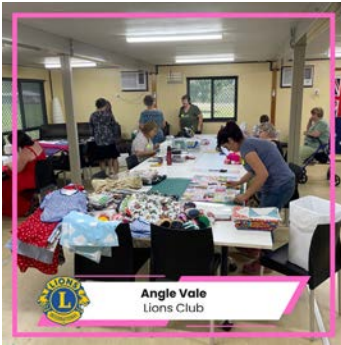
Angle Vale Lions Club