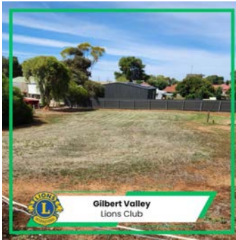
Gilbert Valley Lions Club