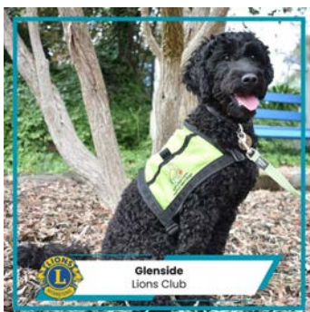
Glenside Lions Club