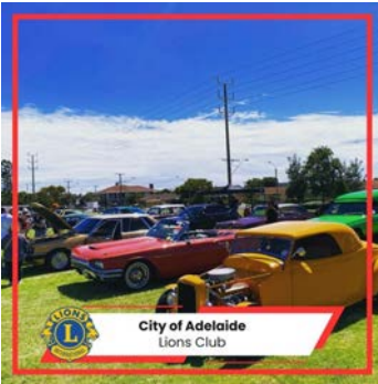
City of Adelaide Lions Club