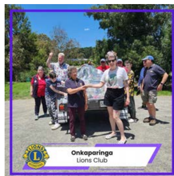
Onkaparinga Lions Club