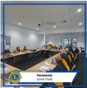
Paralowie Lions Club