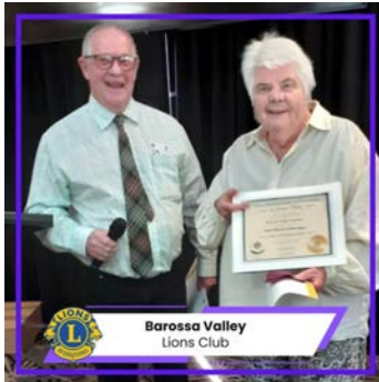
Barossa Valley Lions Club