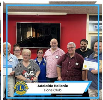
Adelaide Hellenic Lions Club