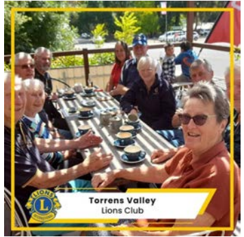
Torrens Valley Lions Club