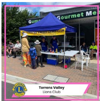
Torrens Valley Lions Club