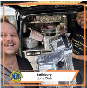
Salisbury Lions Club