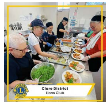
Clare District Lions Club