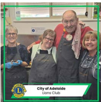
City of Adelaide Lions Club