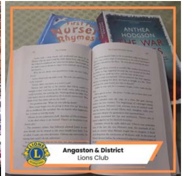
Angaston & District Lions Club