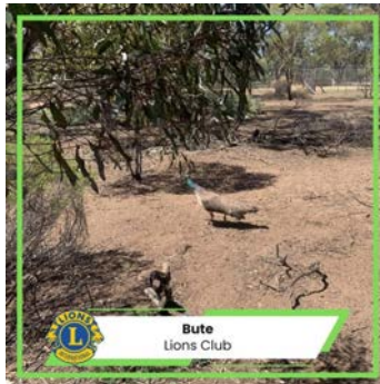
Bute Lions Club