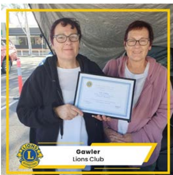
Gawler Lions Club