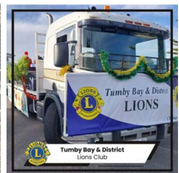
Tumby Bay & District Lions Club