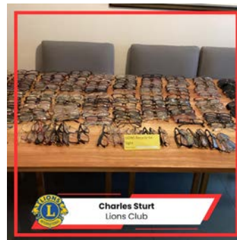
Charles Sturt Lions Club