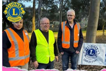
AROUND OUR DISTRICT CHARLES STURT LIONS CLUB