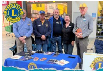
AROUND OUR DISTRICT BAROSSA VALLEY LIONS CLUB