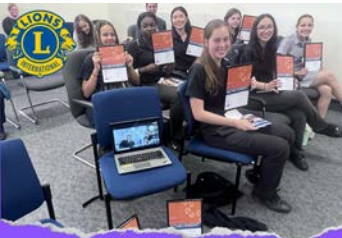
AROUND OUR DISTRICT ATHELSTONE-ROSTREVOR LIONS CLUB