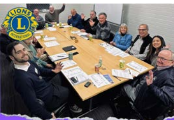
AROUND OUR DISTRICT PROSPECT-BLAIR ATHOL LIONS CLUB