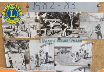
AROUND OUR DISTRICT BOULEROO CENTRE & DISTRICTS LIONS CLUB