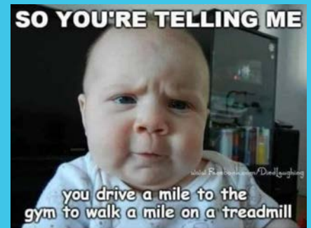
From Modbury Lions Club

It was time for the final and one student wanted to get at least one right answer on the chemistry test.