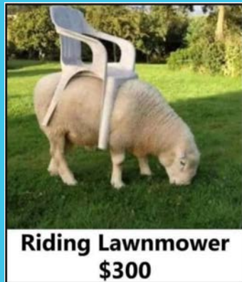
From Stansbury Dalrymple Lions Club

I was having dinner with Garry Kasparov (World Chess Champion) and there was a check tablecloth. It took him two hours to pass me the salt.