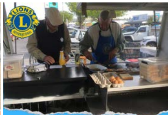
AROUND OUR DISTRICT PORT LINCOLN LIONS CLUB