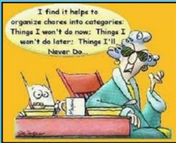
From Stansbury Dalrymple Lions Club