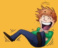
From Clare District Lions Club

We'll see who's overdramatic in about 5 minutes.