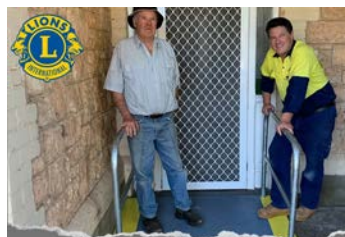
AROUND OUR DISTRICT BALAKLAVA & DISTRICTS LIONS CLUB