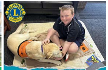
AROUND OUR DISTRICT MOONTA LIONS CLUB