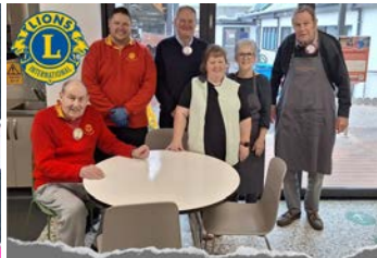
AROUND OUR DISTRICT CITY OF ADELAIDE LIONS CLUB