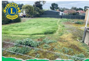
AROUND OUR DISTRICT GILBERT VALLEY LIONS CLUB