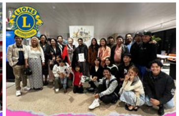
AROUND OUR DISTRICT PARALOWIE LIONS CLUB