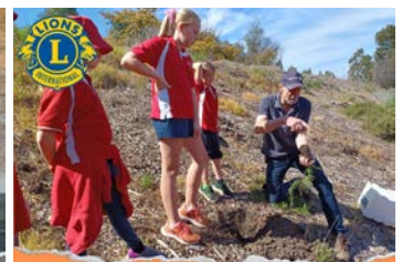
AROUND OUR DISTRICT CLARE DISTRICT LIONS CLUB