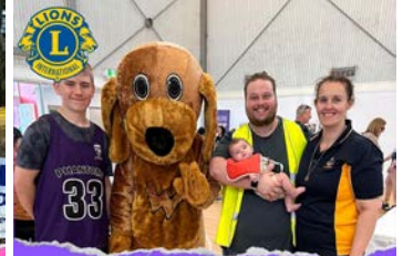
AROUND OUR DISTRICT SALISBURY LIONS CLUB