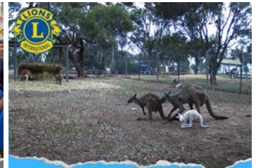
AROUND OUR DISTRICT BUTE LIONS CLUB