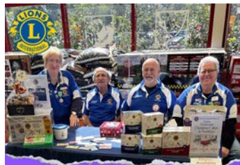
AROUND OUR DISTRICT ADELAIDE HELLENIC LIONS CLUB