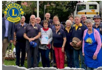
AROUND OUR DISTRICT TORRENS VALLEY LIONS CLUB