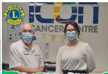
AROUND OUR DISTRICT GILLES PLAINS LIONS CLUB