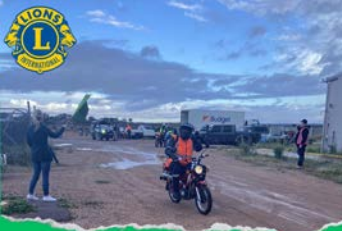
AROUND OUR DISTRICT PORT AUGUSTA LIONS CLUB