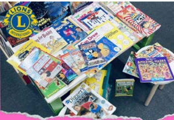
AROUND OUR DISTRICT GLENSIDE LIONS CLUB