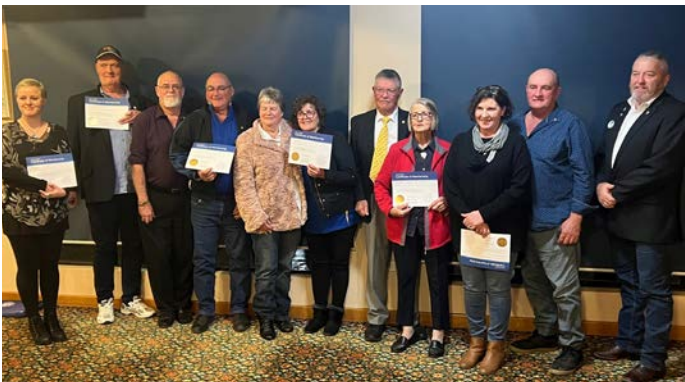
Lions Club of Kimba welcoming new Lion members to the club at their Club Handover.