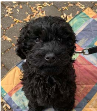
Glenside Lions Club's Lions Hearing Dog, Leonie.