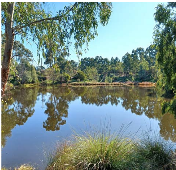
Gleeson Wetlands - Clare & District Lions Club