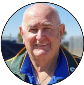
PDG Lance Leak OAM Constitution & By-Laws