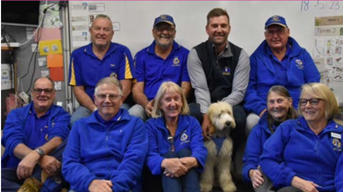
A good roll out of members from Port Augusta Lions Club to meet Murphey the Australian Cobber companion dog for Stirling North Primary School