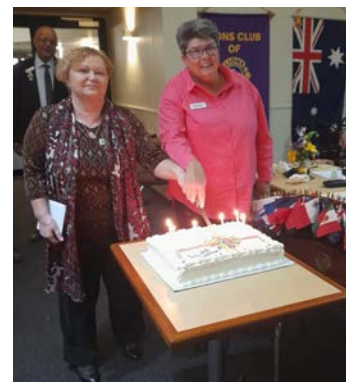
Gilles Plains Lions Club Handover.