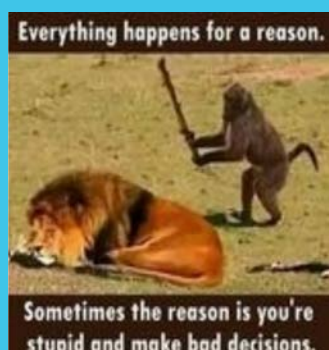
From Stansbury Dalrymple Lions Club