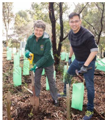
Lions from Golden Grove and City of Adelaide, together with Pedare Pride Cubs and Cub Mentors, joined the Tea Tree Gully Council Community Tree Planting event. Golden Grove Lions provided a delicious sausage sizzle for all the volunteers too.