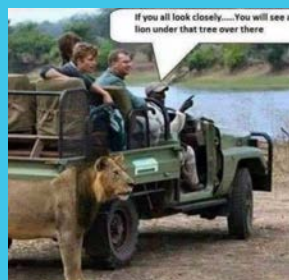
From Clare & District Lions Club