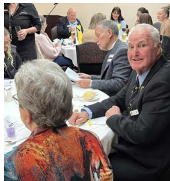
Gawler Lions Club Handover.