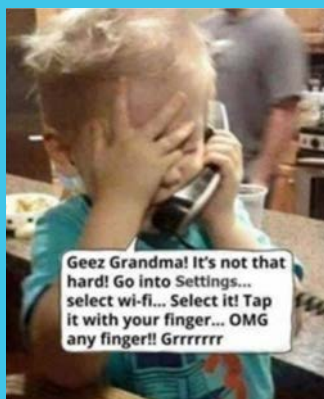
From Gilles Plains Lions Club