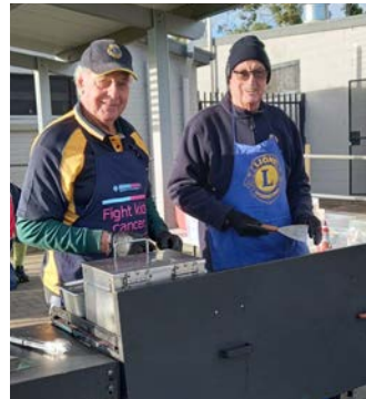
SANFL Game Day for Elizabeth Playford Lions.