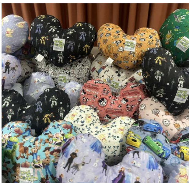
Hear Me Roar! Project - City of Adelaide Lions Club