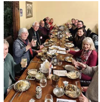
Prospect-Blair Athol Lions Club Handover.