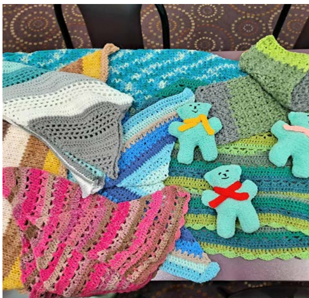
Crocheted Items for People in Need - Paralowie Lions Club