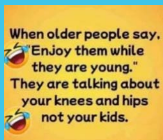
From Stansbury Dalrymple Lions Club