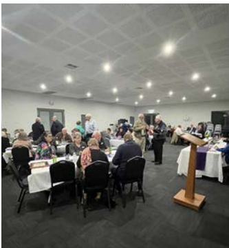
Angaston & District Lions Club Handover.