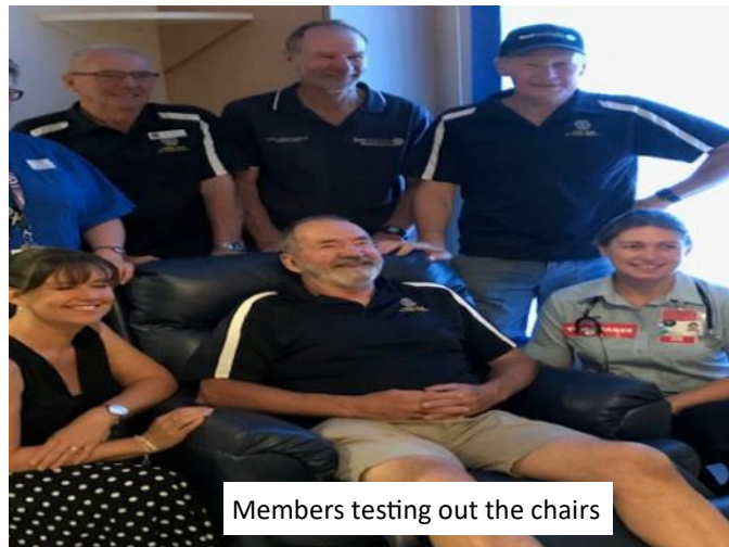
Members testing out the chairs

Recently it was agreed by the club members that a portion of the funds, $4,000.00, raised from this project over the past 6 months should go towards the purchase of 4 Recliners for the Clare Hospital to replace the existing chairs purchased in 2002.