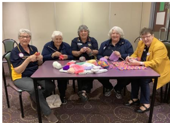
Lions Club of Paralowie Happy knitters for the Lyell McEwin and nursing homes.

1,150 beanies knitted in the last year, 12 knee rugs for nursing homes and three blankets for Blanket Salisbury, eight beanies and scarfs for the homeless, Well done girls