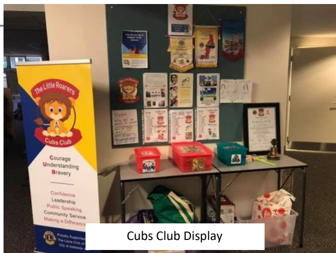
Cubs Club Display