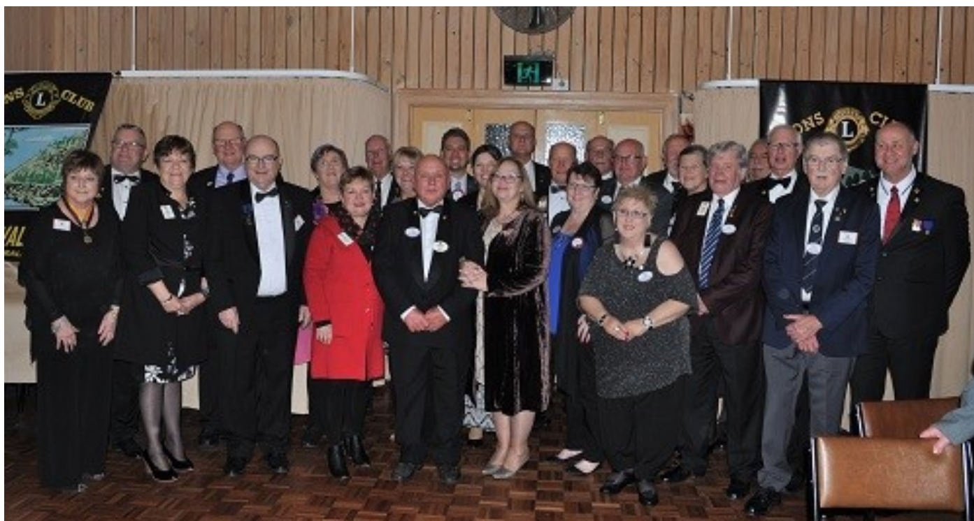
District Cabinet Members for 2019/2020