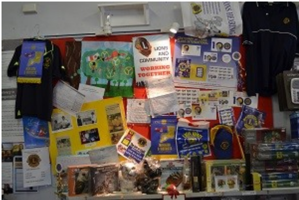
Photo: Display in Minlaton Post Office

Minlaton Post Office and the Minlaton and Districts Lions and Lioness Clubs have combined to celebrate 100 years of Lions Clubs International with the launch of the Centenary Stamps and a display in the Post Office in June. Included in the display was a poster advertising the Centenary Stamps and current and past items from the Minlaton and Districts Lions and Lioness Clubs which have been serving the district for 48 years.