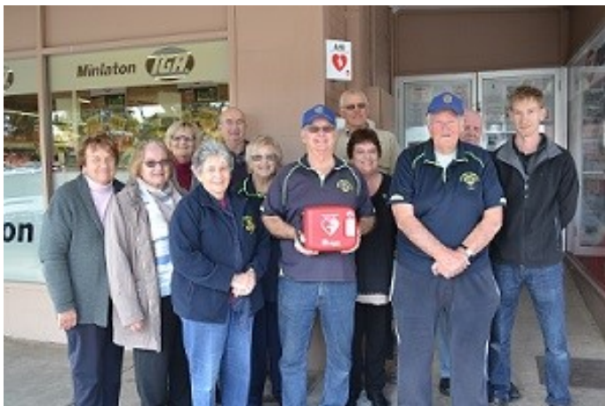
Photo. Lions and Lioness members with representatives from Minlaton IGA, Progress Association, Weight Watchers Club and Garden Club with defibrillator on wall of IGA Supermarket.

The Minlaton and Districts Lions and Lioness Clubs together with Minlaton Progress Association, Weight Watchers Club and Garden Club have donated a heart defibrillator which has been placed in an alarmed box outside the Minlaton IGA Supermarket for use by the public in case of an emergency. Training in its use will be given to some IGA staff and interested Lions Members and the public.