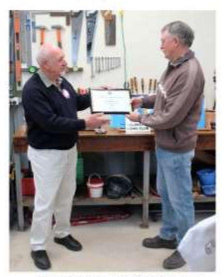
Presentation of a Certificate of Appreciation