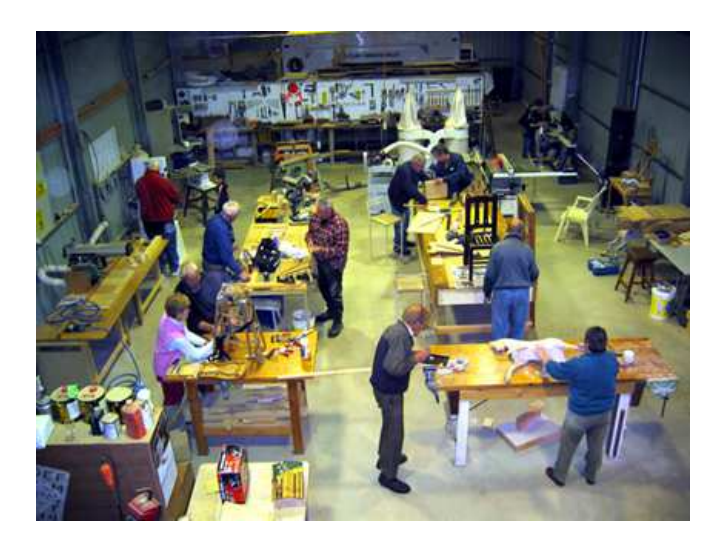
The Tinkers Shed on a busy day

The purpose of the Tinkers Shed is to provide a facility in our community where every person can be active, creative, learn and improve their skills and feel satisfied with their accomplished projects. We promote safety awareness along with health awareness in a friendly supportive atmosphere