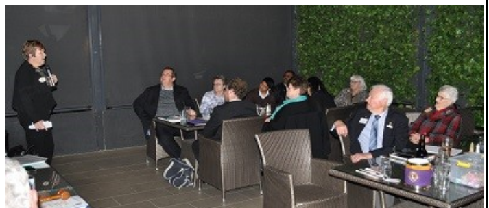
DG Megan addressing the captive audience at the Gilles Plains meeting.

Singing in the shower is all fun and games until you get shampoo in your mouth. Then it becomes a soap opera.