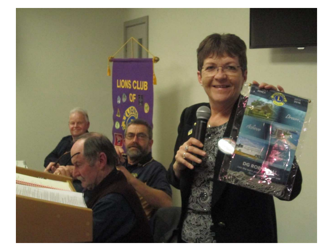
Vice District Governor's Visit