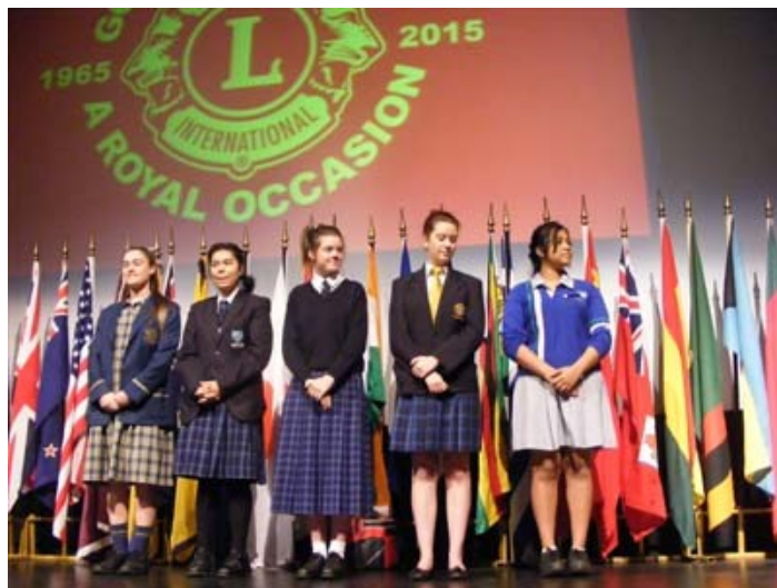
The Youth of the year Contestants