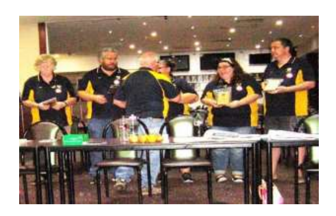
Educate for Change, Break the Cycle

Many thanks to Angaston and Moonta and also an anonymous lady from Pooraka for saving the ring pulls for the Lions Club of Paralowie, we have passed them onto the Viet Nam vets.