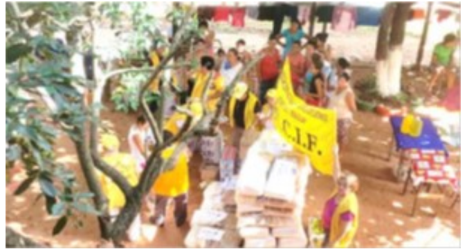
LCIF was there to assist flood victims in Paraguay

District C1 LCIF & International Relations Chairman