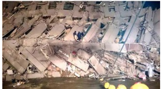
and also Earthquake victims near the city of Tainan, Taiwan