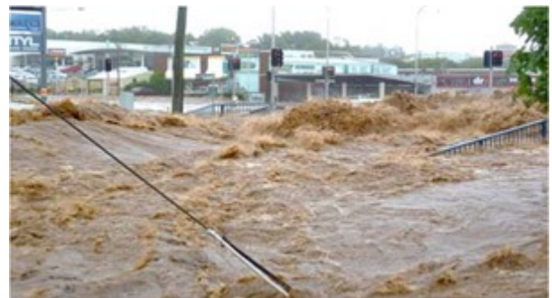
And at home Floods in Toowoomba