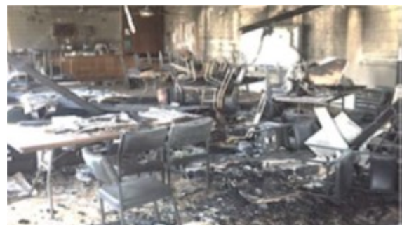
and also The Pinery fires