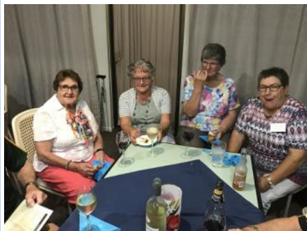
Di entertaining First Conventioners from Cleve Lions Club