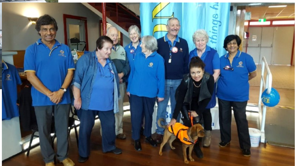
The Reception Committee plus 'Doug' who drew most attention