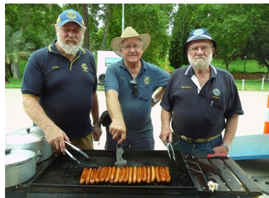
Modbury Sausage Sizzlers