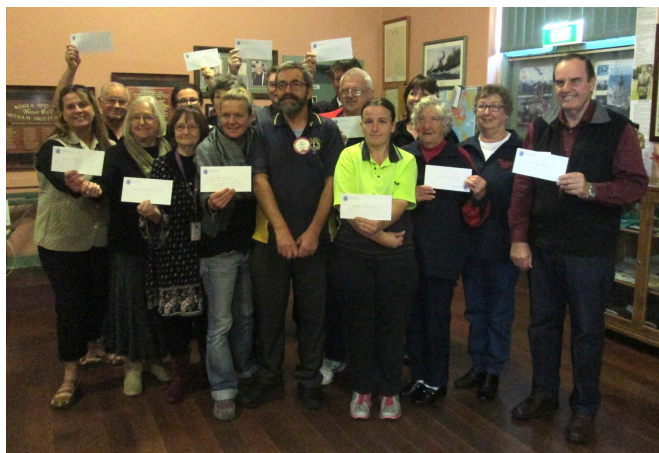
representatives of some organisations helped by Port Lincoln Lions.

One Tuesday morning we presented sponsoring cheques to several local charities and clubs. The morning tea was beautifully catered for by the RSL, where it was held.