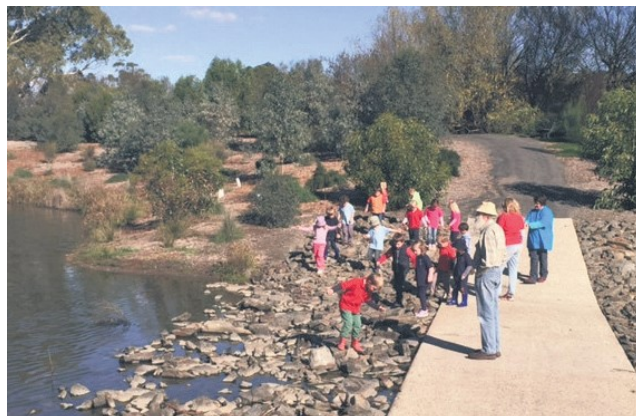
Time for a rest and a photo opportunity in front of the Torii gate sign. Say cheese!