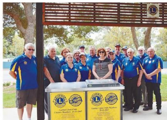
Lions Club of Gawler members all came together to celebrate on Sunday.

"The thing that was reminiscent for me on the night, though, was how many great characters that we have had over the years."