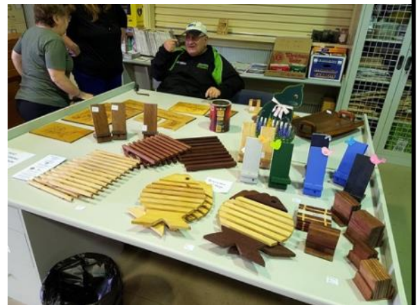
Products made by Barossa Village participants