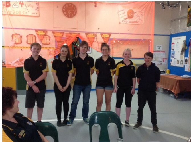
Scout dinner -our cooks

The Awards would not be possible without the support of the organisations and special schools, and their staff that support children with disabilities.