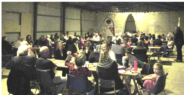
Quiz night to support the Royal Flying Doctors.