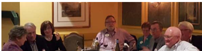
At Burnside Dinner Meeting