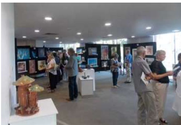
Part of the crowd viewing the entries.

A mechanic was removing a cylinder-head from the motor of a Harley motorcycle when he spotted a well-known cardiologist in his shop. The cardiologist was there waiting for the service manager to come and look at his bike when the mechanic shouted across the garage: "Hey Doc, want to look at this?" The cardiologist, a bit surprised, walked over to where the mechanic was working on the motorcycle. The mechanic straightened up, wiped his hands on a rag and asked, "So Doc, look at this engine. I open its heart, take the valves out, repair any damage, and then put them back in, and when I finish, it works just like new. So how come I make $39,675 a year and you get the big bucks when you and I are doing basically the same work?"